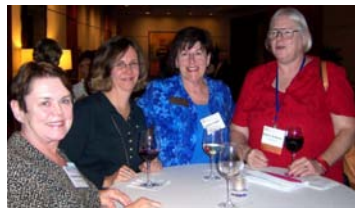
LOVELY ZONTA LADIES AT CONFERENCE 2009