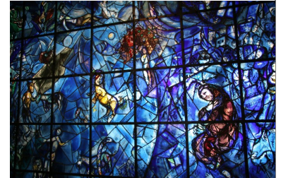
Pictured above is a stained glass window that hangs in the main entrance of the United Nations building.

system accountable for its own commitments on gender equality which will include monitoring on system-wide progress. GEAR (Gender Equality Architecture Reform) has worked hard over the past 4 years to help to have this new entity become a reality. The Secretary-General has said that it will be operational by January 2011 and its head will have the title of Under Secretary-General.