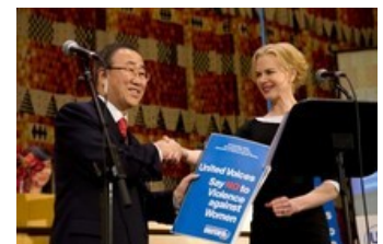
Pictured above are UN Secretary-General Ban Ki-moon and Nicole Kidman at the kickoff of the global call for action Say NO—UNITE to End Violence against Women which was launched in November 2009.